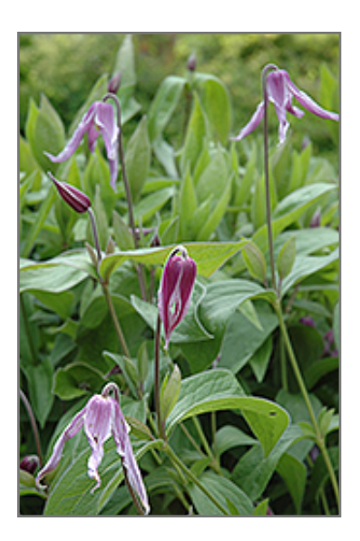
Rose Colored Glasses Solitary Clematis flowers