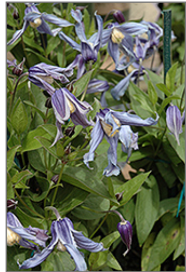
Caerulea Solitary Clematis flowers

Caerulea Solitary Clematis is recommended for the following landscape applications;