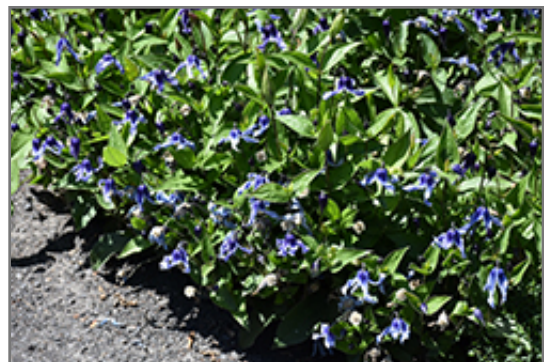
Caerulea Solitary Clematis in bloom