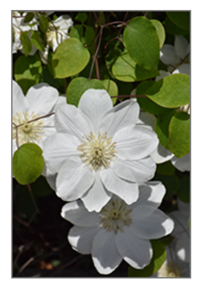
Guernsey Cream Clematis flowers

Guernsey Cream Clematis is recommended for the following landscape applications;