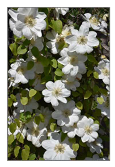
Guernsey Cream Clematis flowers