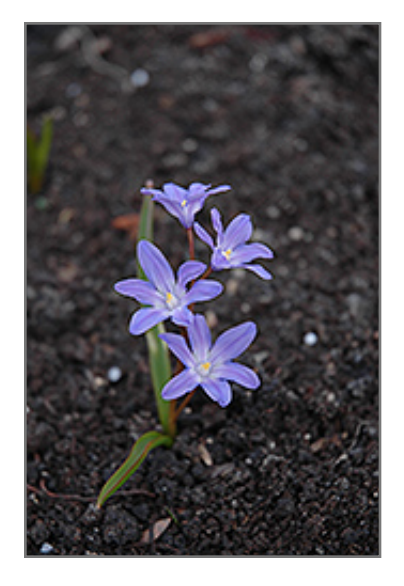
Glory of the Snow flowers