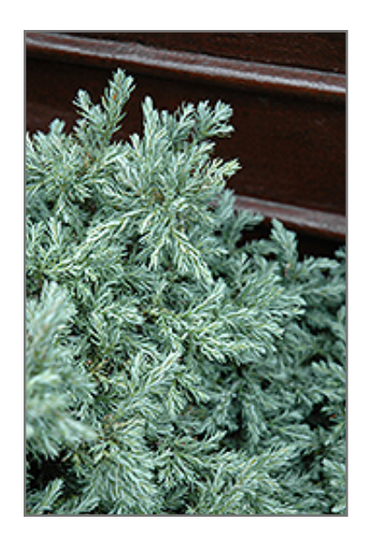
Baby Blue Moss Falsecypress foliage