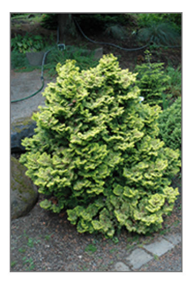
Lynn's Golden Dwarf Hinoki Falsecypress

Lynn's Golden Dwarf Hinoki Falsecypress is a dwarf conifer which is primarily valued in the landscape or garden for its distinctively pyramidal habit of growth. It has attractive gold evergreen foliage. The scale-like sprays of foliage are highly ornamental and remain gold throughout the winter.