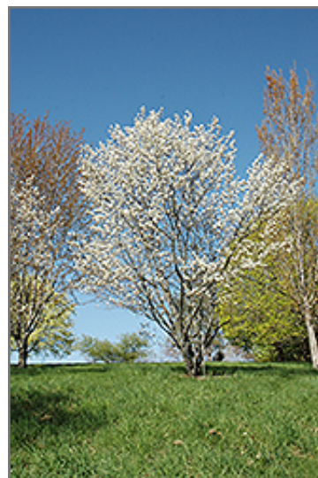
Princess Diana Serviceberry in bloom