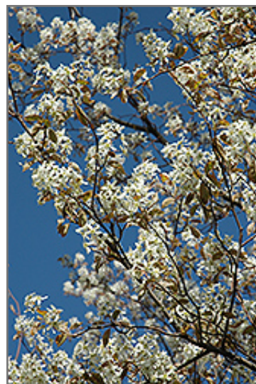
Princess Diana Serviceberry flowers