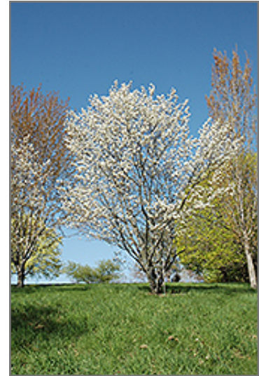
Princess Diana Serviceberry in bloom