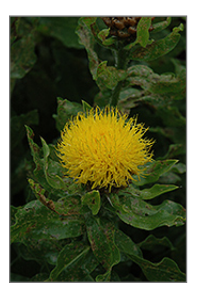
Globe Centaurea flowers