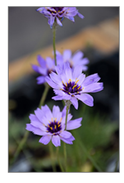
Cupid's Dart flowers

Cupid's Dart is recommended for the following landscape applications;