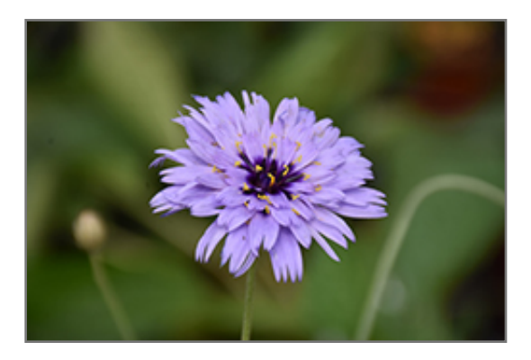
Cupid's Dart flowers