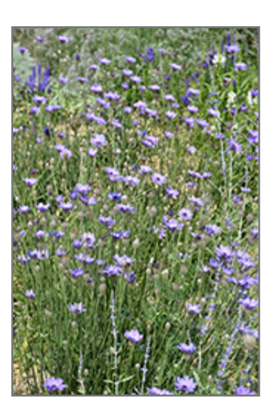
Cupid's Dart in bloom

This plant should only be grown in full sunlight. It prefers dry to average moisture levels with very well-drained soil, and will often die in standing water. It is considered to be drought-tolerant, and thus makes an ideal choice for a low-water garden or xeriscape application. It is not particular as to soil type or pH. It is somewhat tolerant of urban pollution. This species is not originally from North America.