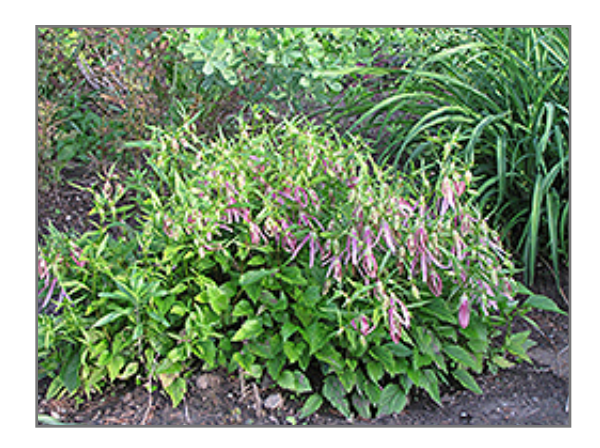
Pink Octopus Bellflower in bloom