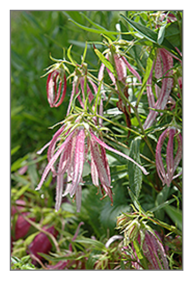
Pink Octopus Bellflower flowers

This is a high maintenance plant that will require regular care and upkeep, and is best cleaned up in early spring before it resumes active growth for the season. Gardeners should be aware of the following characteristic(s) that may warrant special consideration;