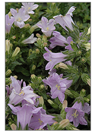
Divine Lavender Peachleaf Bellflower flowers

Divine Lavender Peachleaf Bellflower features showy spikes of lavender bell-shaped flowers rising above the foliage from early to late summer. The flowers are excellent for cutting. Its narrow leaves remain light green in colour throughout the season.