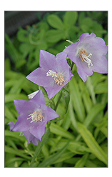
Blue Eyed Blonde Peachleaf Bellflower flowers

Blue Eyed Blonde Peachleaf Bellflower features showy spikes of blue bell-shaped flowers rising above the foliage from early to late summer. The flowers are excellent for cutting. Its attractive narrow leaves remain gold in colour throughout the season.