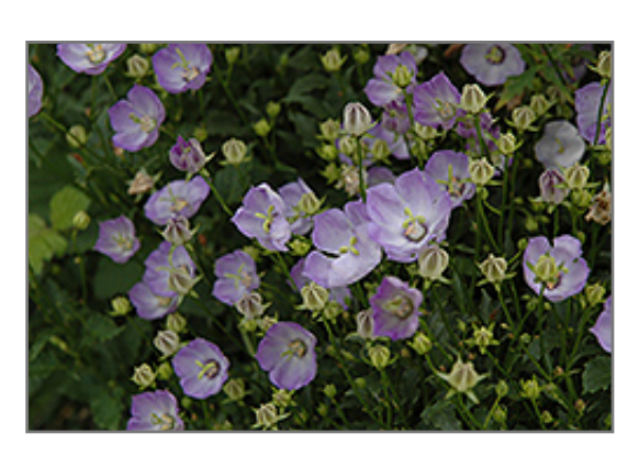
Samantha Bellflower flowers

Pretty violet-blue bellflowers are richly fragrant; neat, compact plant, perfect for rock gardens and edges; low maintenance, deadhead for extended bloom; attracts hummingbirds and butterflies