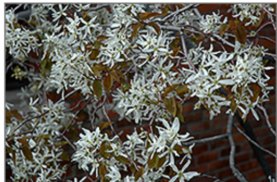
Autumn Brilliance Serviceberry flowers