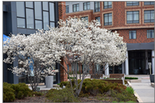
Autumn Brilliance Serviceberry in bloom

Autumn Brilliance Serviceberry is recommended for the following landscape applications;