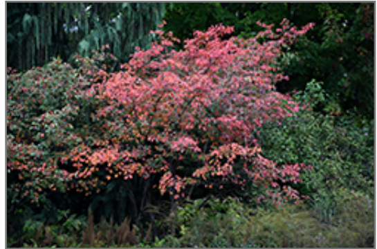
Autumn Brilliance Serviceberry in fall

This tree does best in full sun to partial shade. It prefers to grow in average to moist conditions, and shouldn't be allowed to dry out. It is not particular as to soil type or pH. It is somewhat tolerant of urban pollution. This particular variety is an interspecific hybrid.