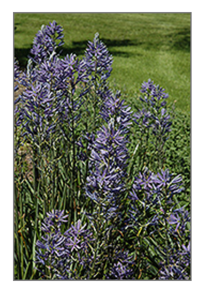
Blue Danube Camassia flowers

This plant will require occasional maintenance and upkeep, and is best cleaned up in early spring before it resumes active growth for the season. Deer don't particularly care for this plant and will usually leave it alone in favor of tastier treats. It has no significant negative characteristics.