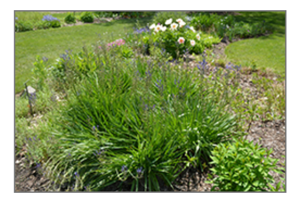
Blue Danube Camassia in bloom