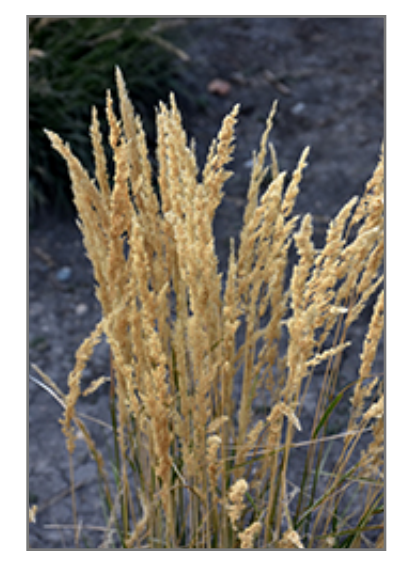
El Dorado Feather Reed Grass fruit

This plant does best in full sun to partial shade. It is very adaptable to both dry and moist locations, and should do just fine under typical garden conditions. It is not particular as to soil type or pH. It is highly tolerant of urban pollution and will even thrive in inner city environments. This particular variety is an interspecific hybrid. It can be propagated by division; however, as a cultivated variety, be aware that it may be subject to certain restrictions or prohibitions on propagation.