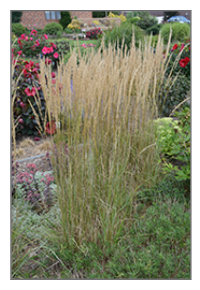
El Dorado Feather Reed Grass

El Dorado Feather Reed Grass is recommended for the following landscape applications;