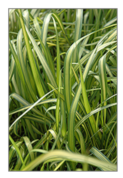
El Dorado Feather Reed Grass foliage