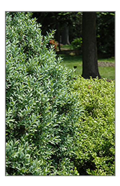
Joy Boxwood foliage

Joy Boxwood is primarily valued in the landscape or garden for its distinctively pyramidal habit of growth. It has dark green evergreen foliage. The small glossy oval leaves remain dark green throughout the winter.