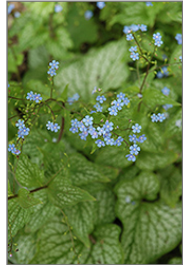
Mr. Morse Bugloss flowers