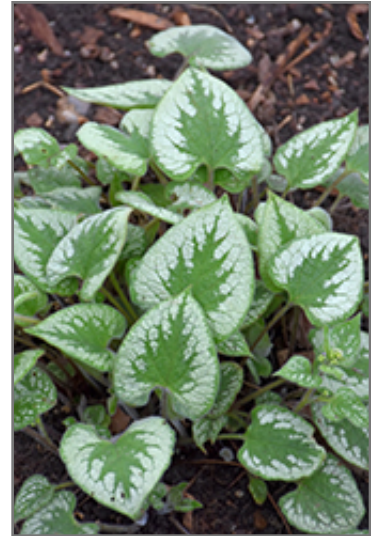
Emerald Mist Bugloss foliage