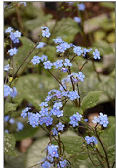
Emerald Mist Bugloss flowers