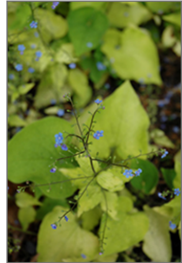
Diane's Gold Bugloss flowers