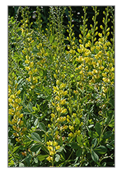
Solar Flare Prairieblues False Indigo flowers

Solar Flare Prairieblues False Indigo is an herbaceous perennial with an upright spreading habit of growth. Its medium texture blends into the garden, but can always be balanced by a couple of finer or coarser plants for an effective composition.