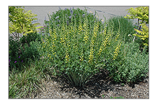
Solar Flare Prairieblues False Indigo in bloom

This is a relatively low maintenance plant, and is best cleaned up in early spring before it resumes active growth for the season. It is a good choice for attracting bees and butterflies to your yard. It has no significant negative characteristics.