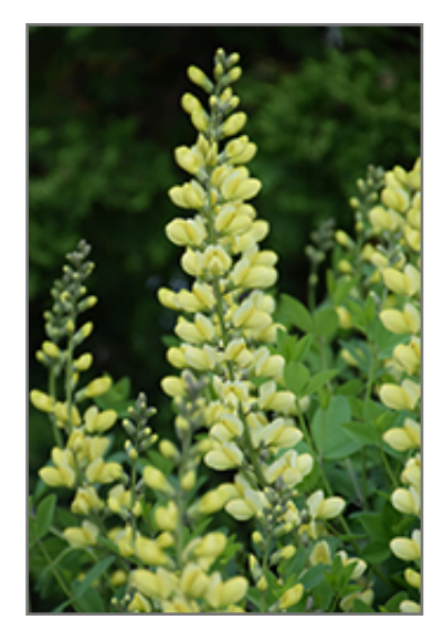
Carolina Moonlight False Indigo flowers

This is a relatively low maintenance plant, and is best cleaned up in early spring before it resumes active growth for the season. It is a good choice for attracting bees and butterflies to your yard. It has no significant negative characteristics.