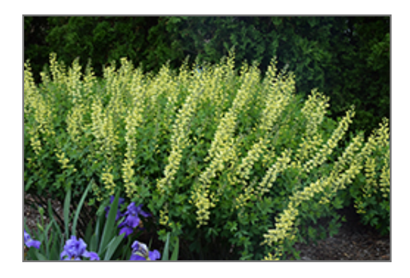
Carolina Moonlight False Indigo in bloom