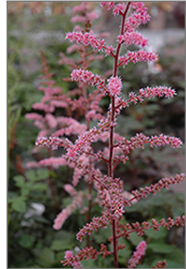
Color Flash Astilbe flowers

Color Flash Astilbe is recommended for the following landscape applications;