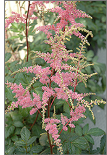
Bressingham Beauty Astilbe flowers