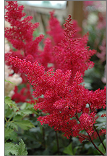
Montgomery Japanese Astilbe flowers