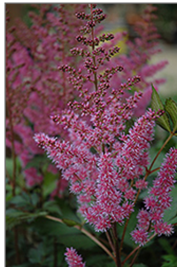
Maggie Daley Astilbe flowers