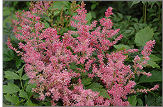
Boogie Woogie Astilbe flowers