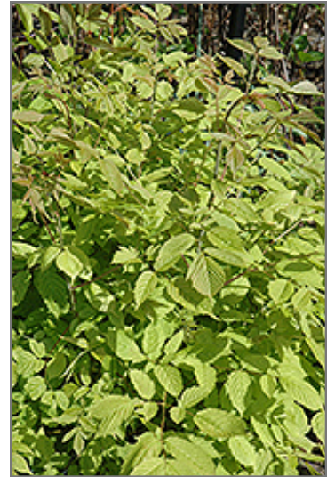
Zweiweltenkind Goatsbeard foliage