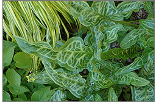
Italian Painted Arum foliage

Other Names: Cuckoo Pint, Lords-and-Ladies, Painted Arum