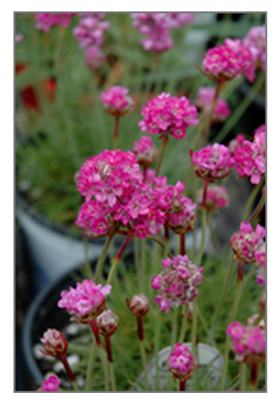
Splendens Sea Thrift flowers

This compact plant is great in rock and alpine gardens; pretty rose-red clusters of flowers rise above glossy, grassy foliage forming a neat clump; will tolerate areas affected by salt and heat