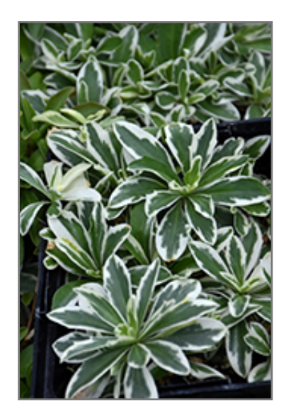
Variegated Alpine Rock Cress foliage