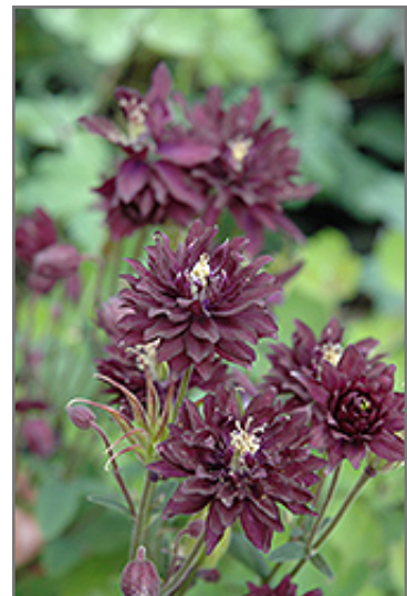
Clementine Dark Purple Columbine flowers