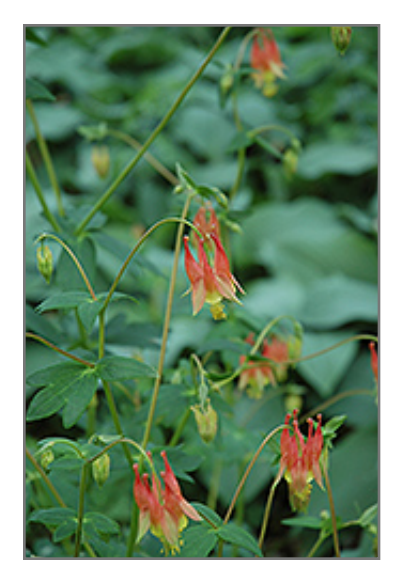
Calimero Columbine flowers

Dainty, nodding, bell-shaped purple and pale yellow flowers on a compact, many-branched plant; makes a welcome addition to shade and woodland gardens