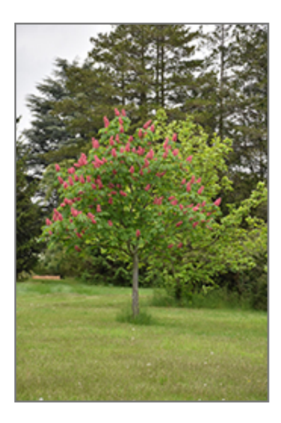
Fort McNair Red Horse Chestnut in bloom