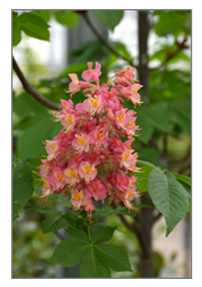
Fort McNair Red Horse Chestnut flowers