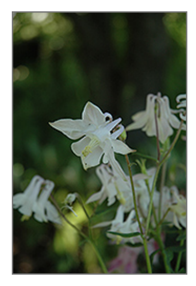
McKana White Columbine flowers