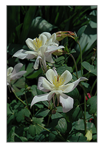
McKana White Columbine flowers

McKana White Columbine is recommended for the following landscape applications;