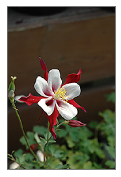
Crimson Star Columbine flowers

This is a relatively low maintenance plant, and should be cut back in late fall in preparation for winter. Deer don't particularly care for this plant and will usually leave it alone in favor of tastier treats. Gardeners should be aware of the following characteristic(s) that may warrant special consideration;