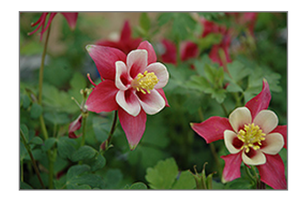
Crimson Star Columbine flowers