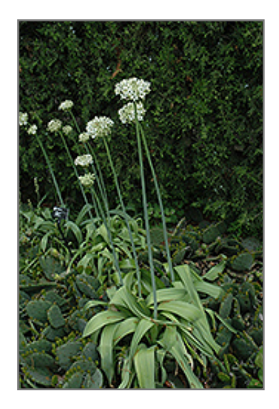
Black Garlic Ornamental Onion in bloom