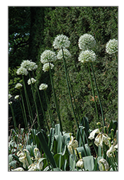
Mount Everest Ornamental Onion in bloom

This is a relatively low maintenance plant, and should only be pruned after flowering to avoid removing any of the current season's flowers. It is a good choice for attracting butterflies to your yard, but is not particularly attractive to deer who tend to leave it alone in favor of tastier treats. It has no significant negative characteristics.