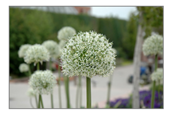
Mount Everest Ornamental Onion flowers

Mount Everest Ornamental Onion is recommended for the following landscape applications;