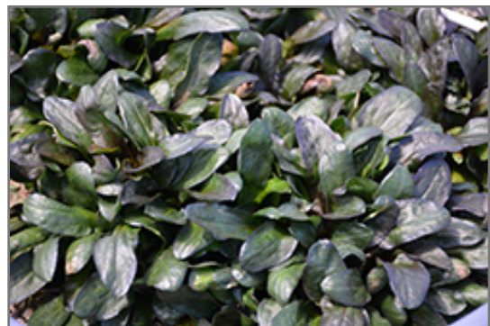
Blueberry Muffin Bugleweed foliage