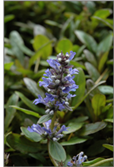
Blueberry Muffin Bugleweed flowers

This plant will require occasional maintenance and upkeep, and should not require much pruning, except when necessary, such as to remove dieback. It is a good choice for attracting bees, butterflies and hummingbirds to your yard, but is not particularly attractive to deer who tend to leave it alone in favor of tastier treats. Gardeners should be aware of the following characteristic(s) that may warrant special consideration;