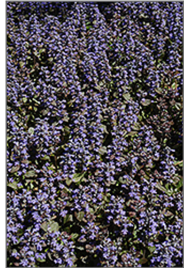
Metallica Crispa Bugleweed in bloom

Metallica Crispa Bugleweed is a dense herbaceous evergreen perennial with a ground-hugging habit of growth. Its medium texture blends into the garden, but can always be balanced by a couple of finer or coarser plants for an effective composition.