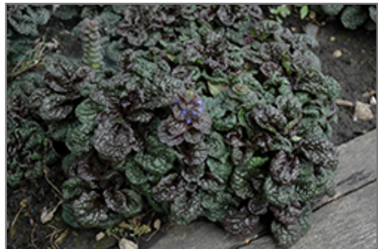
Metallica Crispa Bugleweed