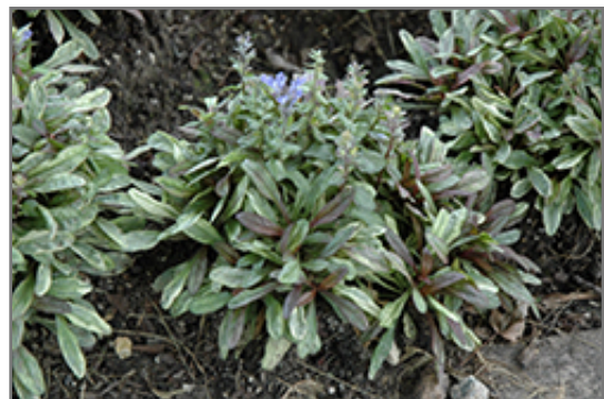
Dixie Chip Bugleweed