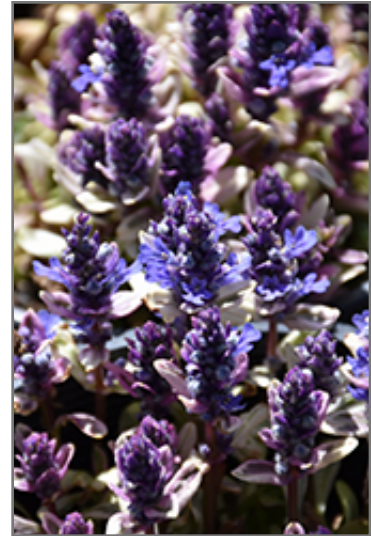
Dixie Chip Bugleweed flowers

Dixie Chip Bugleweed is a dense herbaceous evergreen perennial with a ground-hugging habit of growth. Its relatively fine texture sets it apart from other garden plants with less refined foliage.