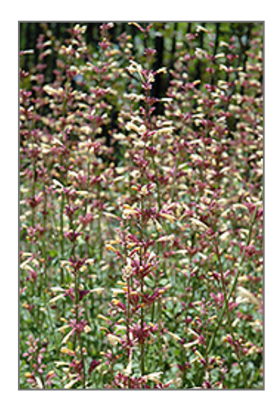
Summer Glow Hyssop flowers

Summer Glow Hyssop is an open herbaceous perennial with an upright spreading habit of growth. Its relatively fine texture sets it apart from other garden plants with less refined foliage.