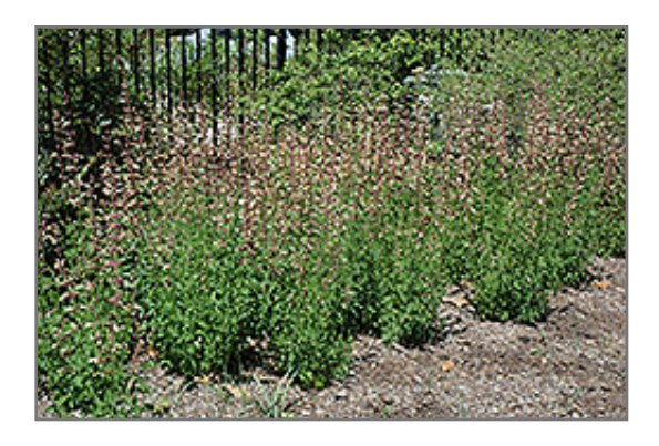
Summer Glow Hyssop in bloom