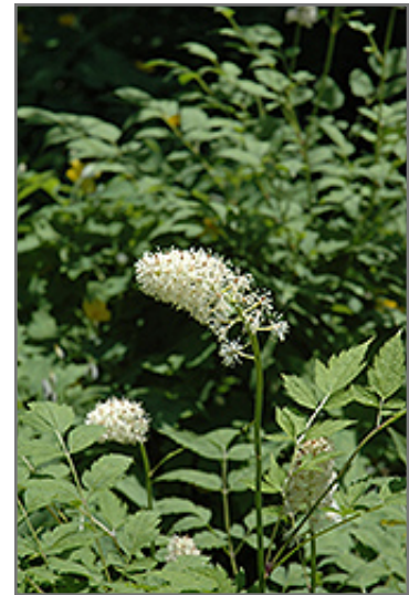
White Baneberry flowers