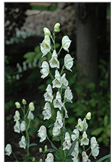
Common White Monkshood flowers