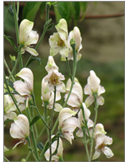
Common White Monkshood flowers