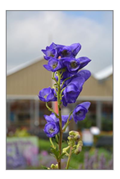
Azure Monkshood flowers