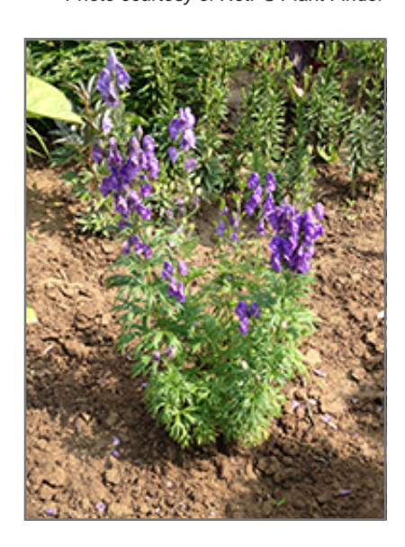
Azure Monkshood in bloom