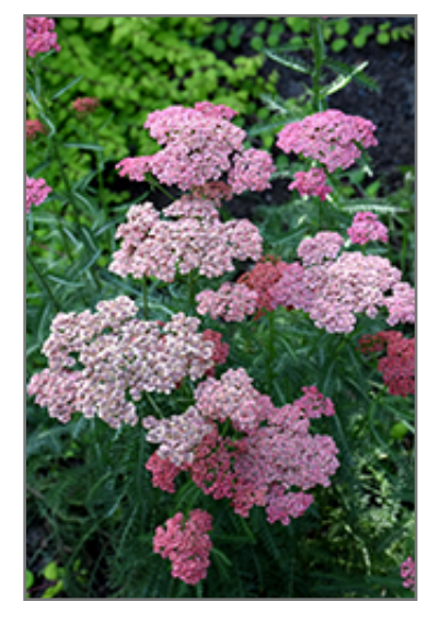
Apricot Delight Yarrow flowers

Apricot Delight Yarrow features showy peach flat-top flowers with pink overtones at the ends of the stems from early to late summer. The flowers are excellent for cutting. Its attractive tomentose ferny leaves remain grayish green in colour throughout the season.