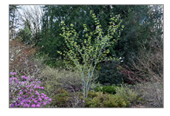
Joe Witt Snakebark Maple

Grown for its striking white and green-striped bark and whitish-green stems which are more vibrant than on the species, buttery fall color; great for the winter landscape but attractive in every season