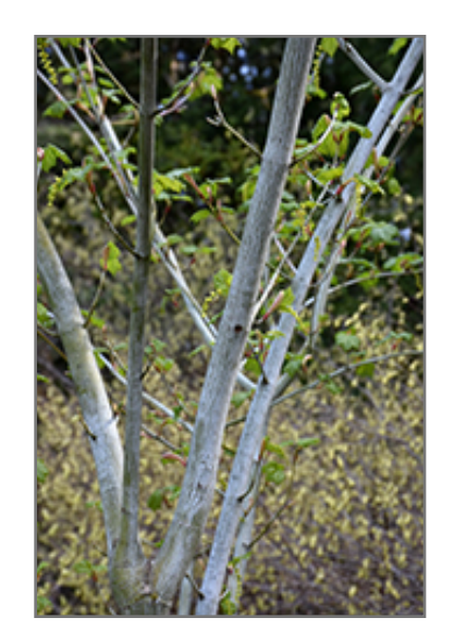
Joe Witt Snakebark Maple bark