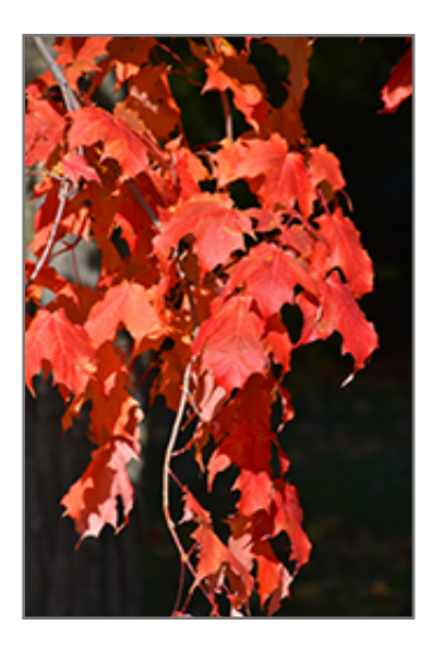
Caddo Sugar Maple in fall