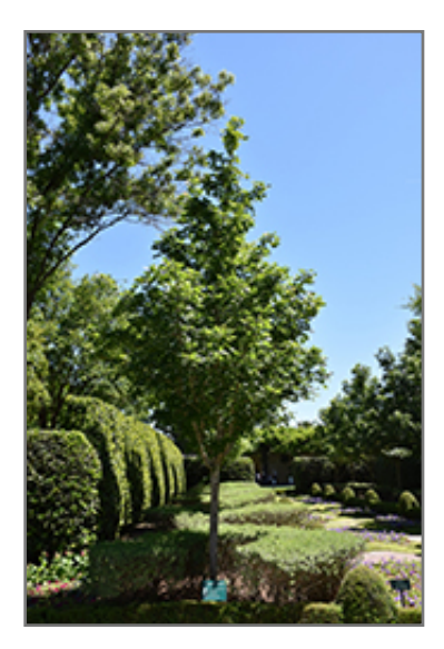
Caddo Sugar Maple