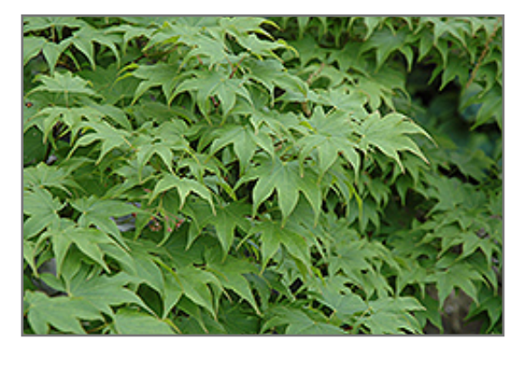
Utsu Semi Japanese Maple foliage

Utsu Semi Japanese Maple is a dense deciduous tree with a more or less rounded form. Its relatively fine texture sets it apart from other landscape plants with less refined foliage.