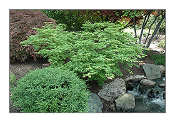
Utsu Semi Japanese Maple

This is a relatively low maintenance tree, and should only be pruned in summer after the leaves have fully developed, as it may 'bleed' sap if pruned in late winter or early spring. It has no significant negative characteristics.