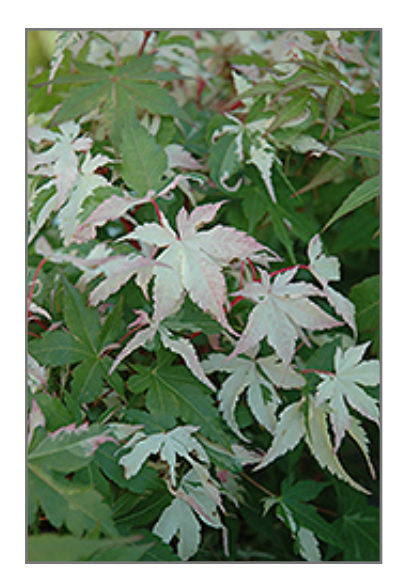
Floating Cloud Japanese Maple foliage